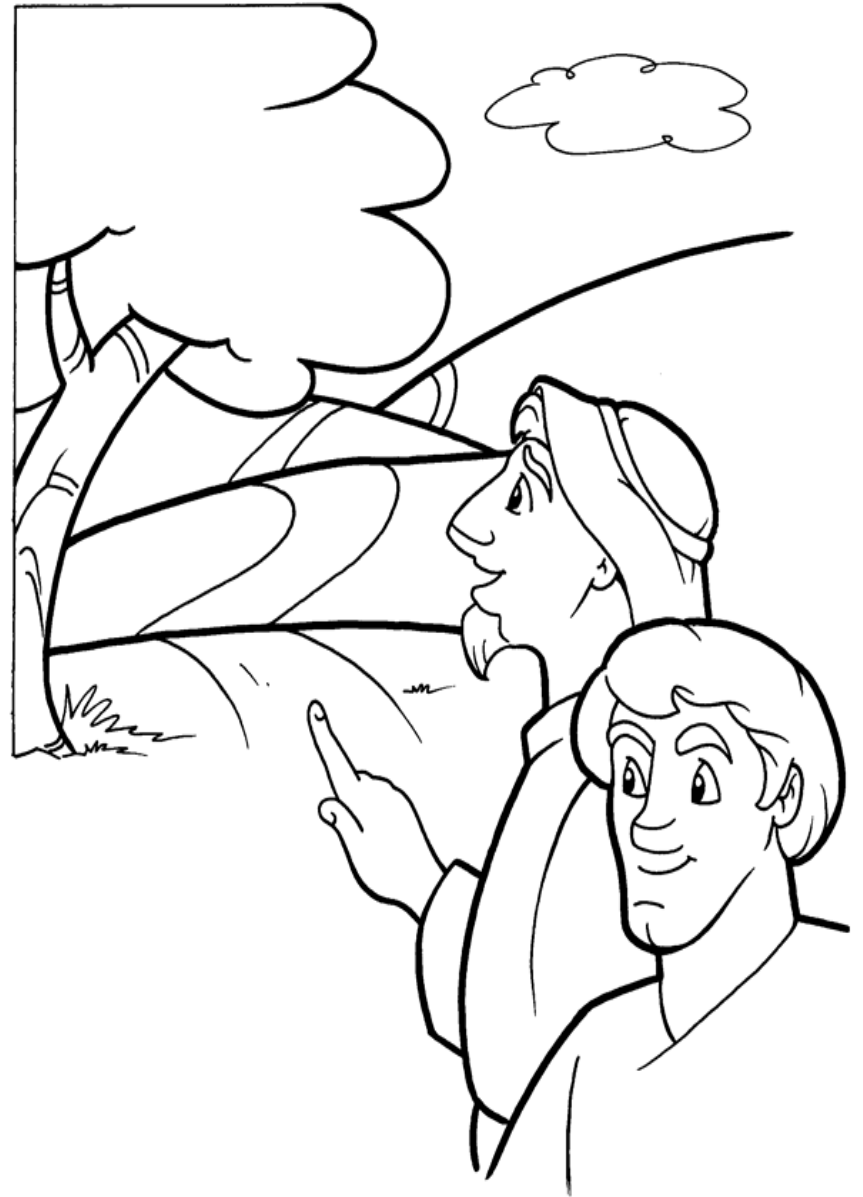
The Road to Emmaus