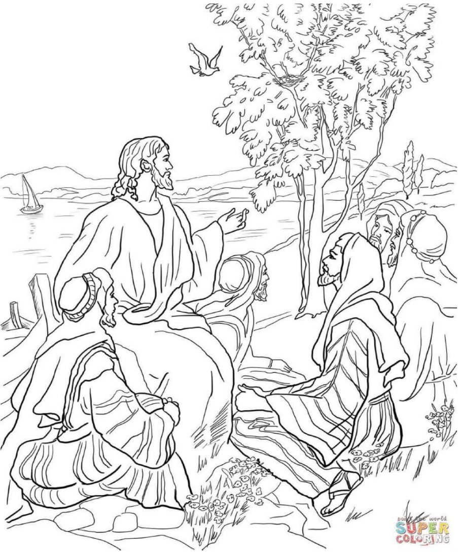
The Parable of the Mustard Seed and the Yeast Matthew 13:31-33