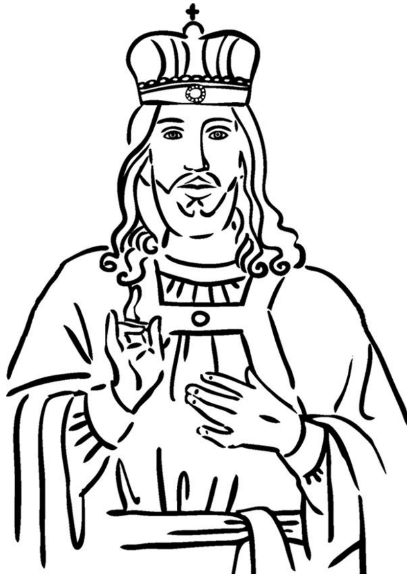
Christ the King John 18:33-37

Each number represents a letter of the alphabet. Substitute the correct letter for the numbers to reveal the coded words.