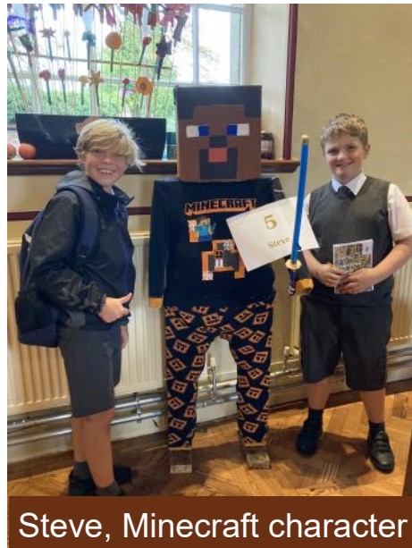
Steve, Minecraft character