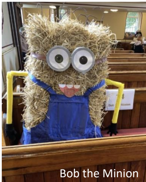
Bob the Minion