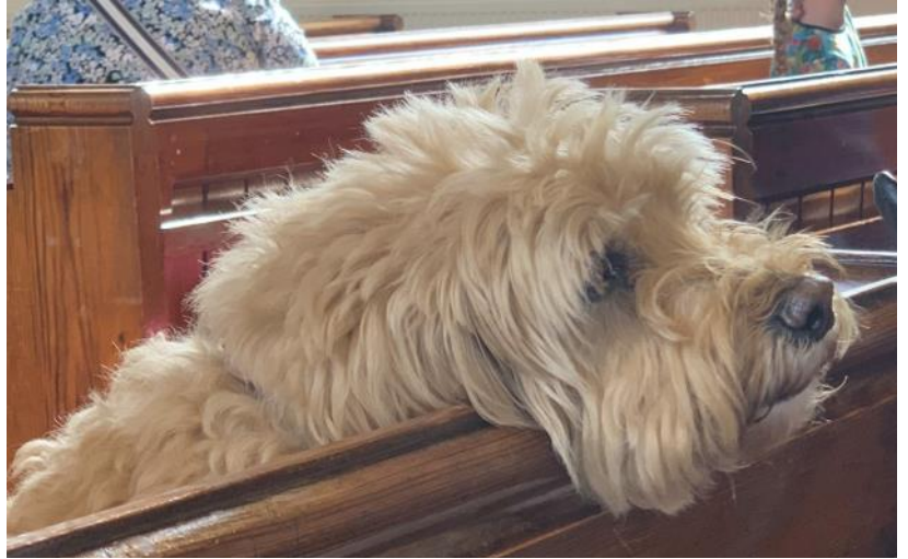
← Little Legs Dogs Re-homing. The dogs are called Dave, Grace & Moody Margaret.