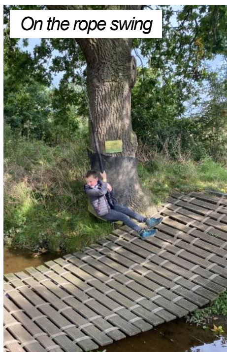
On the rope swing