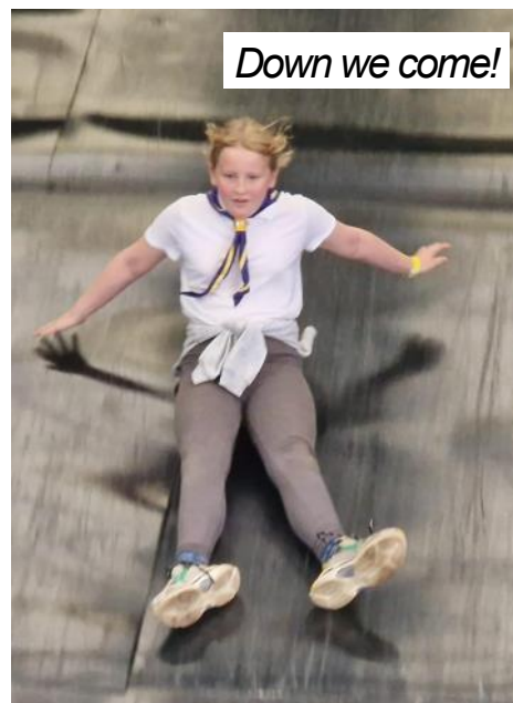
Down we come!