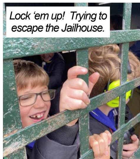
Lock 'em up! Trying to escape the Jailhouse.