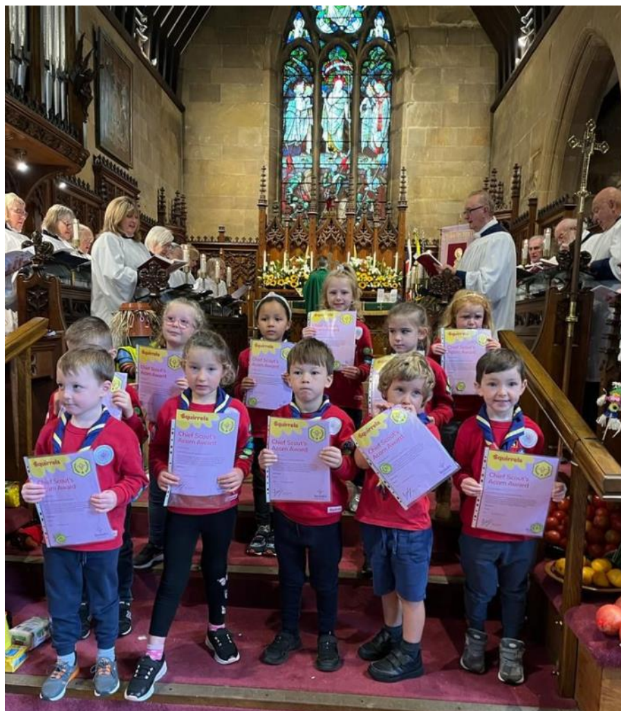
Squirrels receiving their Chief Scout's Acorn Award