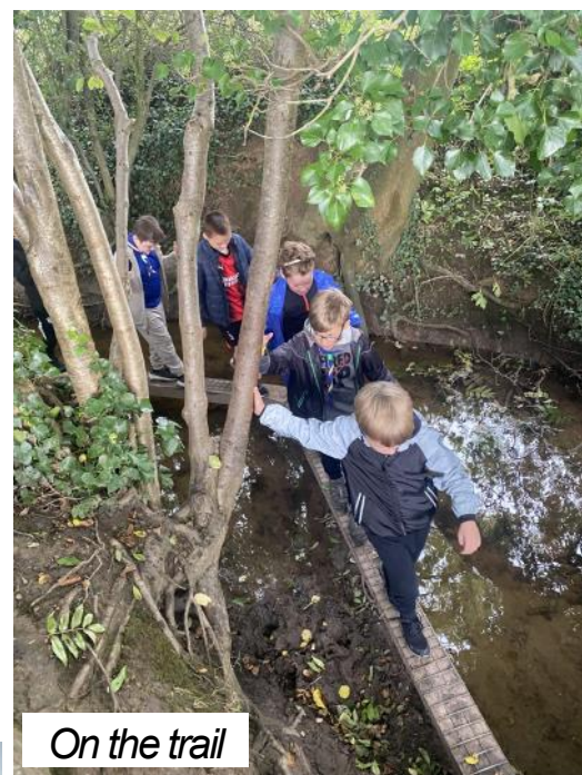
On the trail