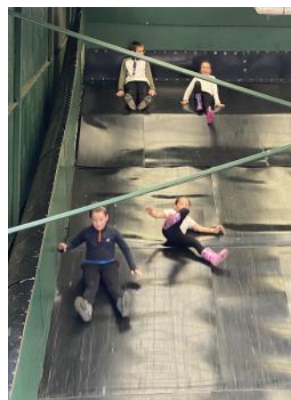
Resistance is futile - down you come!