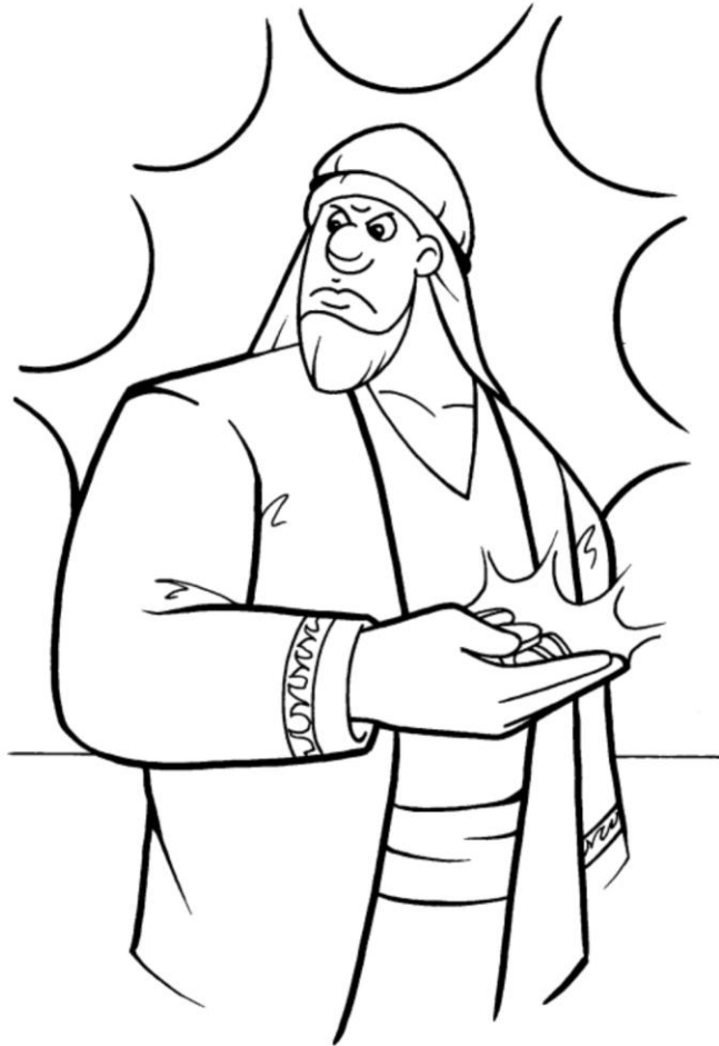
Parable of the Talents (Matthew 25:14-30)