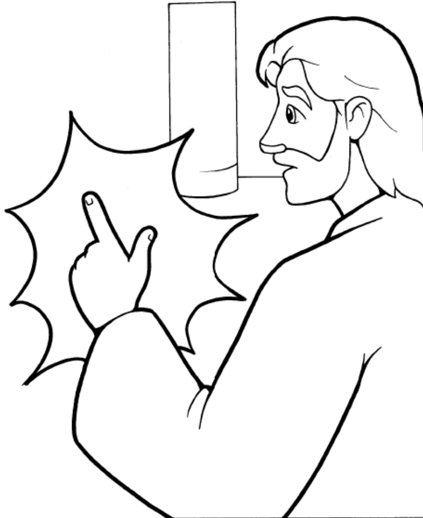
Jesus Appears to the Disciples