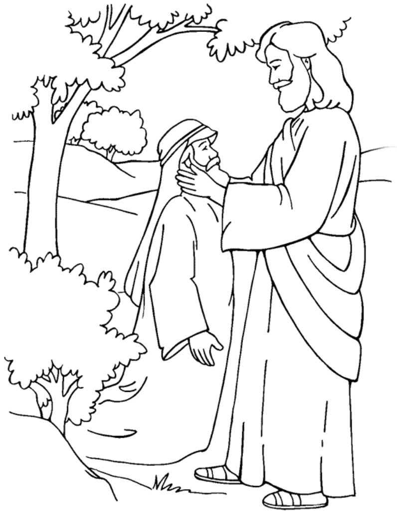
Jesus Heals a Deaf Man Mark 7:31-37

From Thru-the-Bible Coloring Pages for Ages 4-8. © Standard Publishing. Used by permission. Reproducible Coloring Books may be purchased from Standard Publishing, www.standardpub.com , 1-800-543-1301.