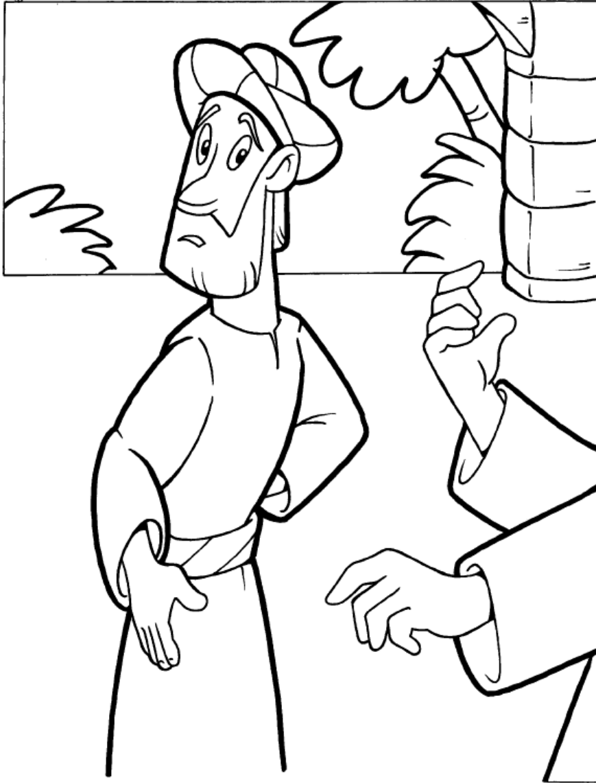
The Rich Young Ruler